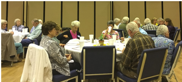
Senior Adult Rally at Unity BC

We understand that the church is the group that God designed to carry the Gospel of Jesus Christ into all the world. We believe this Gospel must go into all the world. We also recognize that pastors, staff, and churches need encouragement and tools from time to time. That is why we are “Churches Serving Together to Make Disciples to Impact the World.”